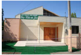
The new church building in San Carlos, Chile. The doors were purchased with gifts from FBC of Manlius.

May the Lord continue to bless your ministry. Mayra”