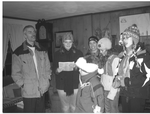
Part of the December 21 st Caroling Crew

January 18 th – Church-wide family event at Highland Forest.